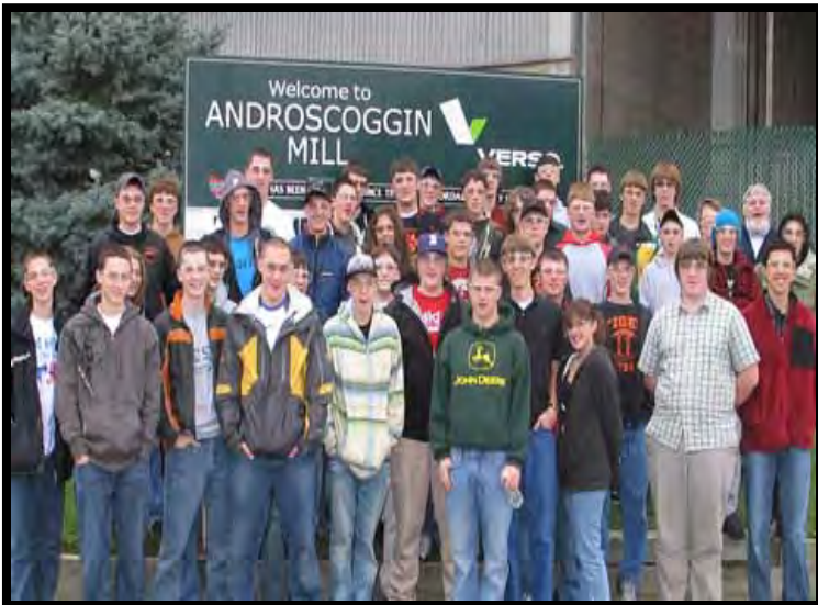
Students attending a Career Exploration Seminar pose for a picture before touring Verso Paper's mill in Jay, ME.